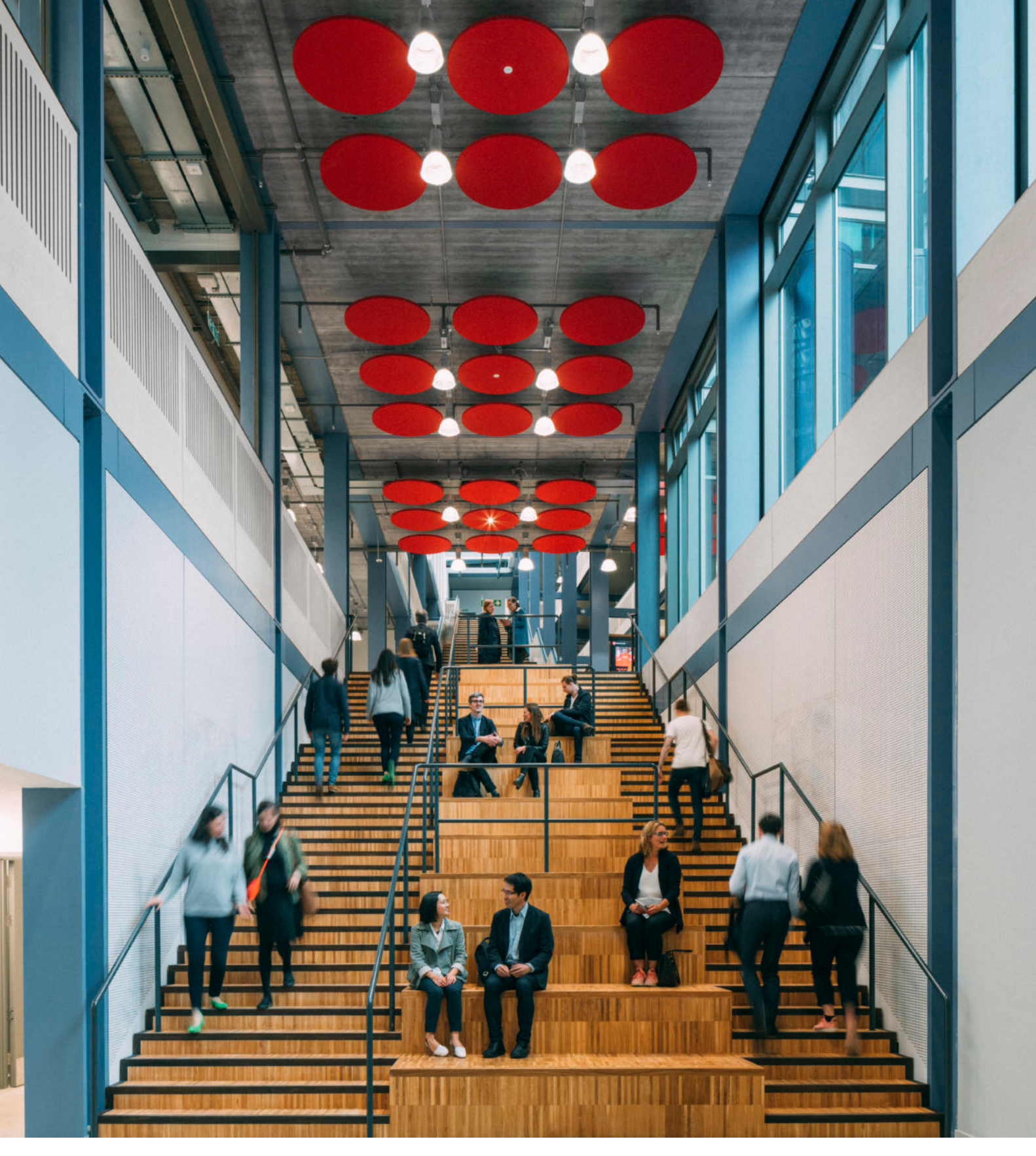
Centre Building at The London School of Economics (LSE)